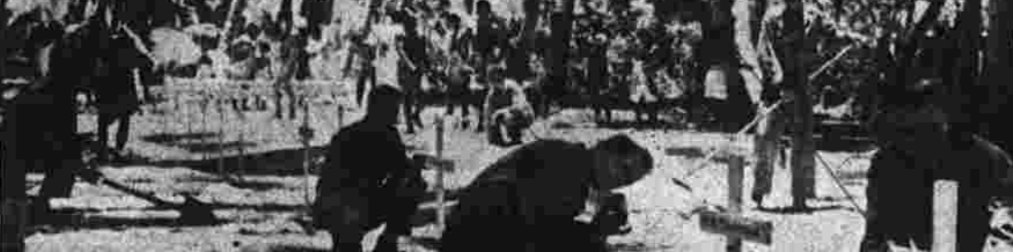
REINFORCES of the many heroic sacrifices in the Tarawa campaign are these graves of Marines (below) on nearby Burial Island.